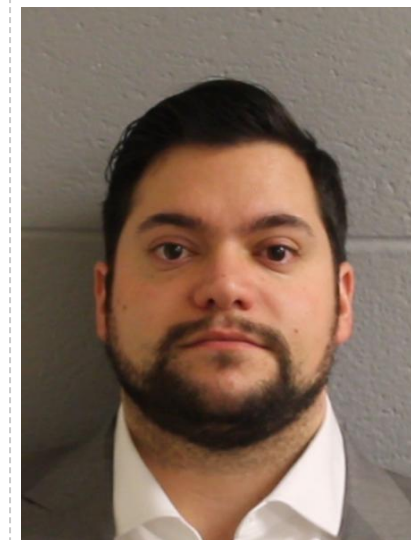
YEHOSHUA s LEIBOWITZ