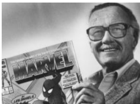
Stan Lee gave comic books permission to be more Jewish