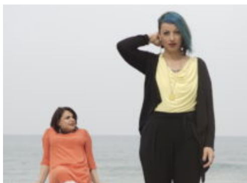
This Israeli documentary about a transgender woman is a real-life version of 'Transparent'