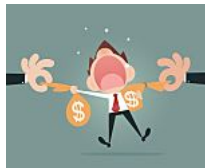
5 Accounting Mistakes to Avoid Paychex