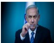
Al-Husseini's critical role in instigating the Holocaust