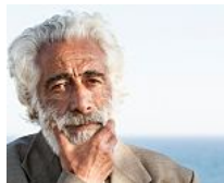
What Happens When You Save 1% More SmartAsset