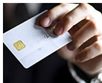
3 Banks Introduce New Cards Paying Unusually High Miles Per Dollar LendingTree