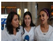
Making aliyah under fire: Now is the time more than ever