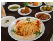
Pea-sized gesture: Arabs, Jews who share hummus get discount