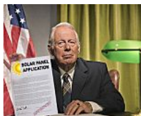
Why Aren't Homeowners Taking Advantage Of Solar Panels? Solarforhomes.com