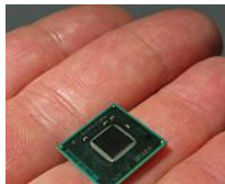
California Power Companies Fear This SunRun