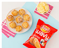
Culinary Experts Create the 1st Lay's Wavy Cookbook Lay's Wavy Pinterest Cookbook