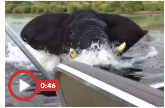
Enraged elephant charges at boat full of tourists