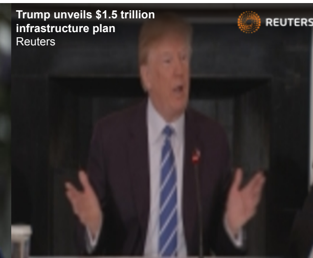
Trump unveils $1.5 trillion infrastructure plan