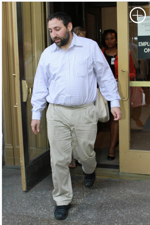
Hayon lost his state Assembly and City Council races.

“children engaged in sexual conduct,” according to the criminal complaint.