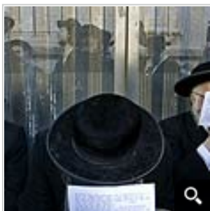
Rabbi detained (Archive)