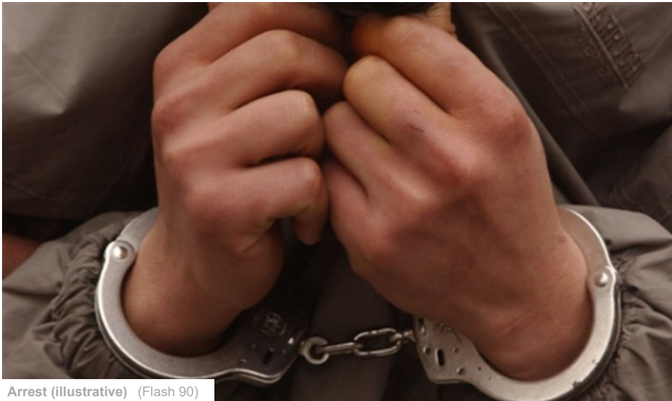
Arrest (illustrative)

An alternative medicine therapist posing as a doctor has been indicted for rape, attempted rape, indecent acts, and fraud, following complaints by four female patients.