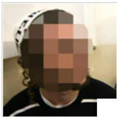
One of the defendants in court