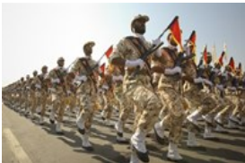
Iran's Revolutionary Guards