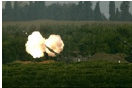
IMI demonstrates new Magic Spear long range artillery system