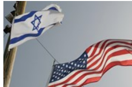
Jewish Chamber of Commerce schedules Israel mission