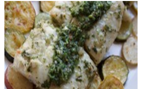
Sheet pan chimichurri cod with potatoes and squash