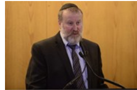
Rabbi to be indicted for incitement to violence