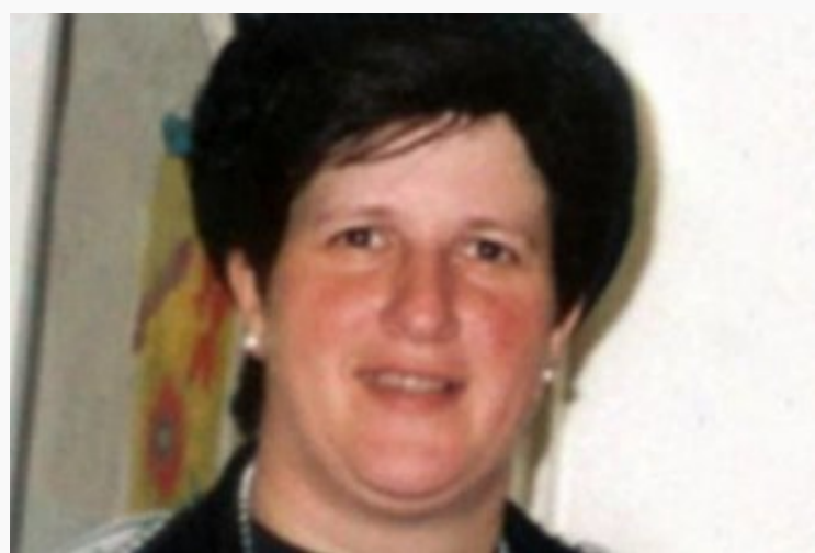
PHOTO: Malka Leifer is wanted by Victorian police on 74 charges of indecent assault and rape.

In 2008, after accusations were first raised against