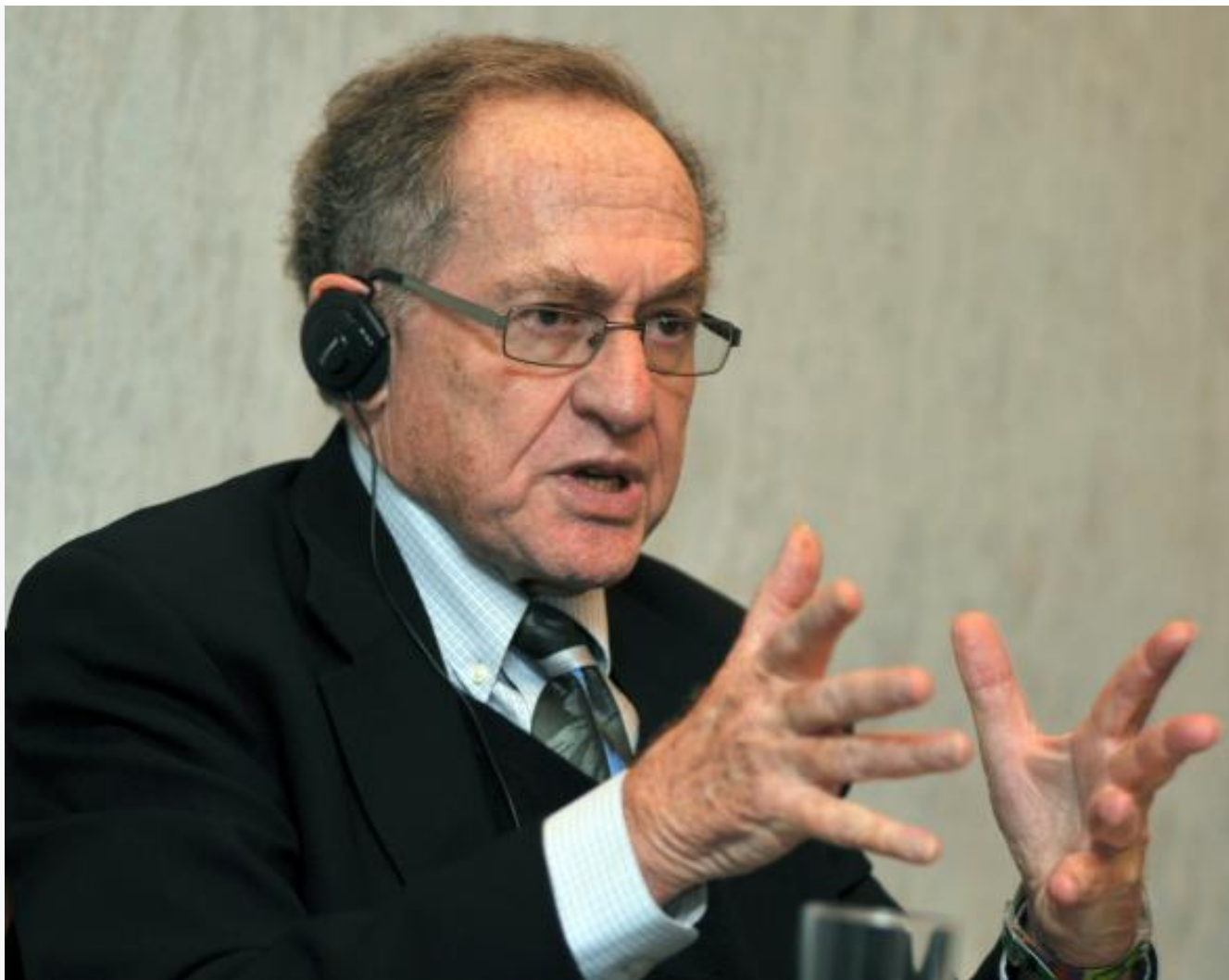
Alan Dershowitz.