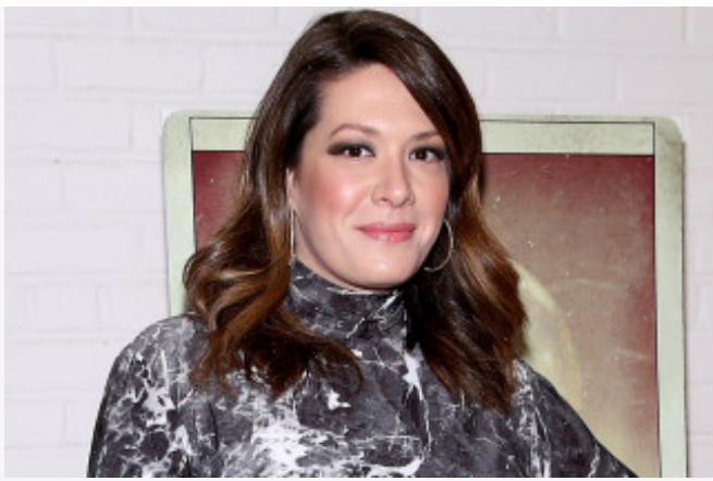
Another 'View' co-host could be headed out the door