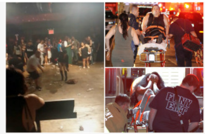
One dead, 3 injured after shooting at T.I. concert