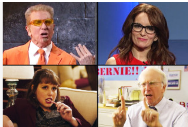
Top 10 'Saturday Night Live' Sketches Of Season 41