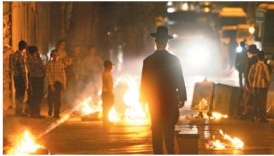
Haredi protesters in Jerusalem.