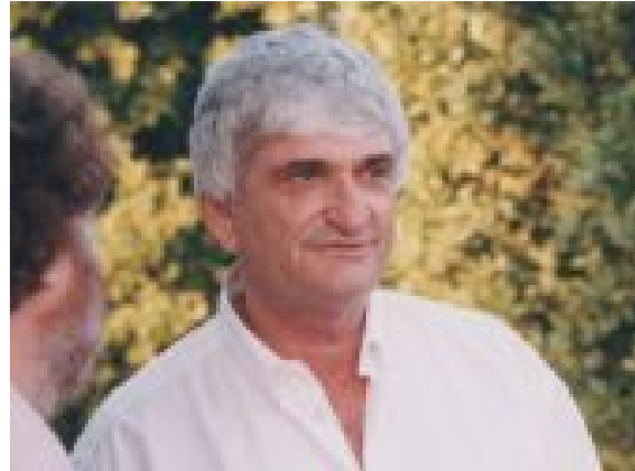
Legendary IDF General Avigdor 'Yanush' Ben-Gal Dead at 80