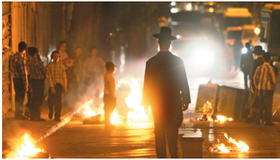
Haredi protesters in Jerusalem.