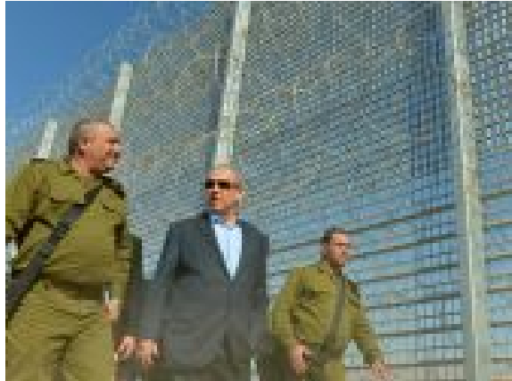
Netanyahu's Beasts of No Nations