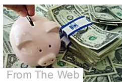
From The Web

Restomods.com Long Forgotten Corvette Collection