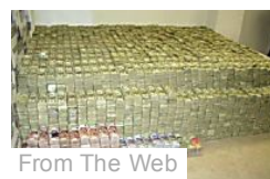
From The Web

ezoven I Used 10 Frugal Tricks to Be Able to Tip My Pizza