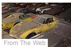
From The Web

Restomods.com Long Forgotten Corvette Collection