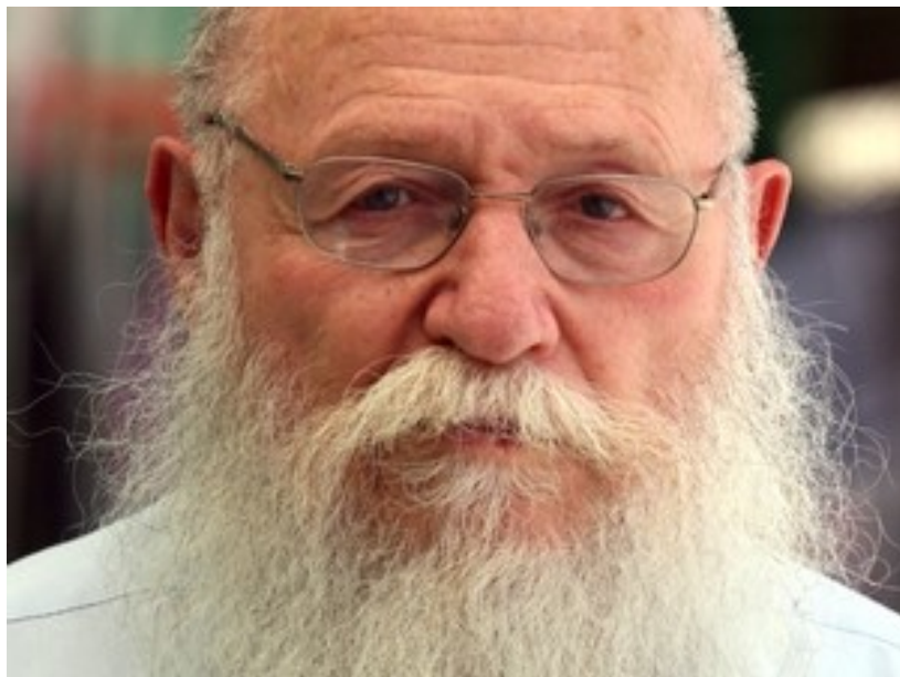
Rabbi Haim Druckman