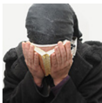
Abusive mother in court