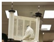
Iran's Hebdo Revenge: Another Holocaust Cartoon Contest