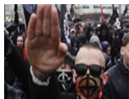
Neo-Nazis Plan Rally in London Jewish Neighborhood