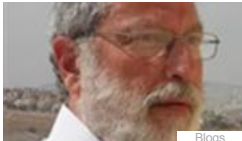
Jerusalem also has a no-go zone