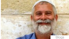
Welcome, Mr. President Blessings from Hebron