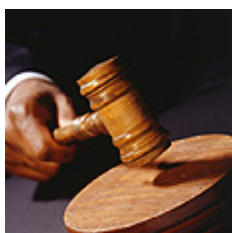
In the courts